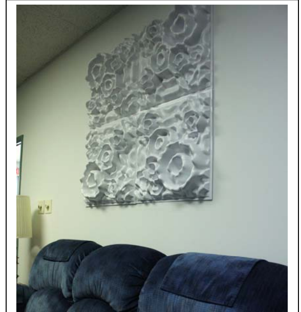
ArtDiffusor® Model D – Factory Finish